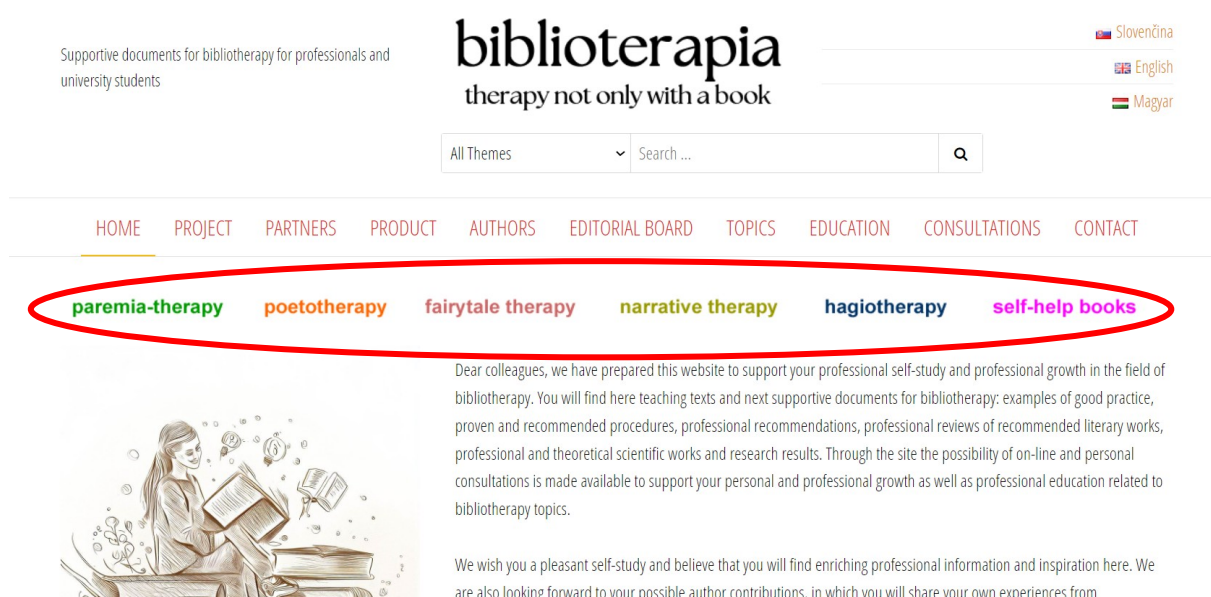
Figure 1. Available at: https://www.biblioterapia.sk/